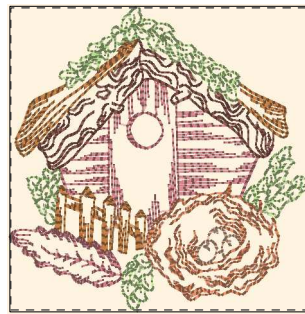
Birdhouse09-4x4.dst 3.35x3.91 inches; 7,114 stitches 6 thread changes; 6 colors