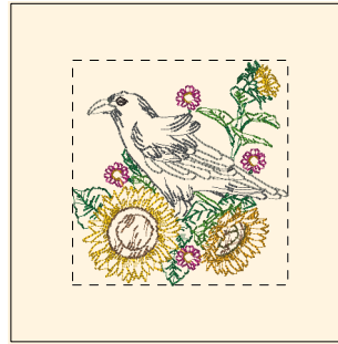
Birds_and_flowers_09-5x7.dst 5.82x5.00 inches; 14,529 stitches 13 thread changes; 13 colors