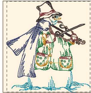
Cheery_snowman_09-4x4.dst 3.35x3.89 inches; 6,565 stitches 6 thread changes; 6 colors