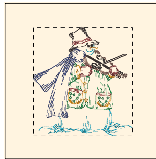
Cheery_snowman_09-5x7.dst 5.00x5.82 inches; 9,161 stitches 6 thread changes; 6 colors