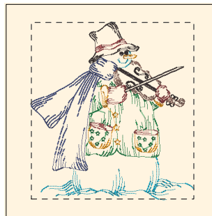
Cheery_snowman_09-6x10.dst 6.00x7.02 inches; 10,868 stitches 6 thread changes; 6 colors