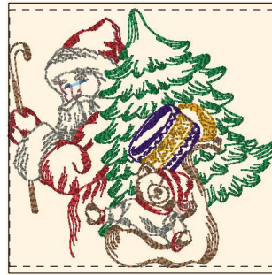
Old_saint_nick_09-4x4.dst 2.21x3.91 inches; 8,626 stitches 8 thread changes; 8 colors