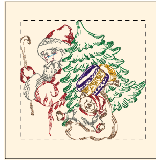
Old_saint_nick_09-6x10.dst 5.65x9.99 inches; 18,569 stitches 8 thread changes; 8 colors